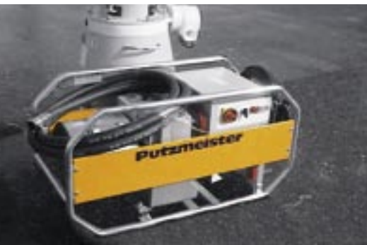
The FAT 400 is a conveying unit without a chassis. It even fits into your estate car.