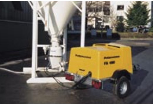
The high delivery pressure of up to 2.8 bar and the large 70 l conveying vessel allow conveying distances of up to 150 m.