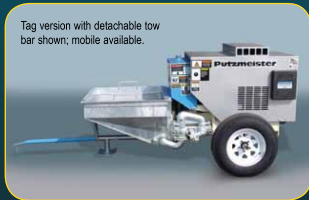
Tag version with detachable tow bar shown; mobile available.