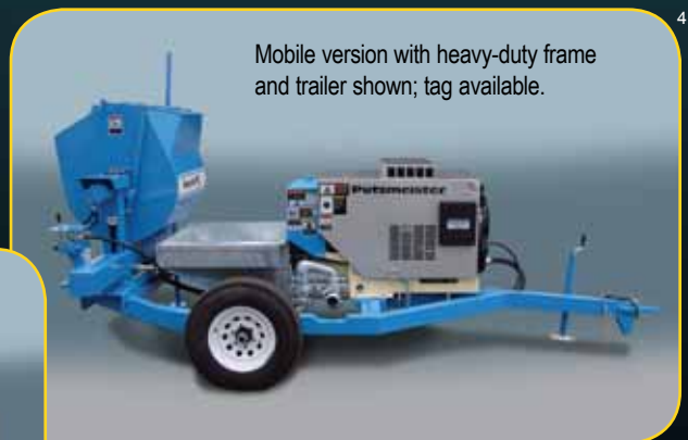
Mobile version with heavy-duty frame and trailer shown; tag available.

IDEAL FOR: Fireproofing • Plaster - Exterior and Interior • Injection Work • Stucco • Kool Decks • Pool Plastering Exposed Aggregate Pools • Mortar • Grouts • Floor Leveling Compounds • Concrete Repairs • Specialty Materials