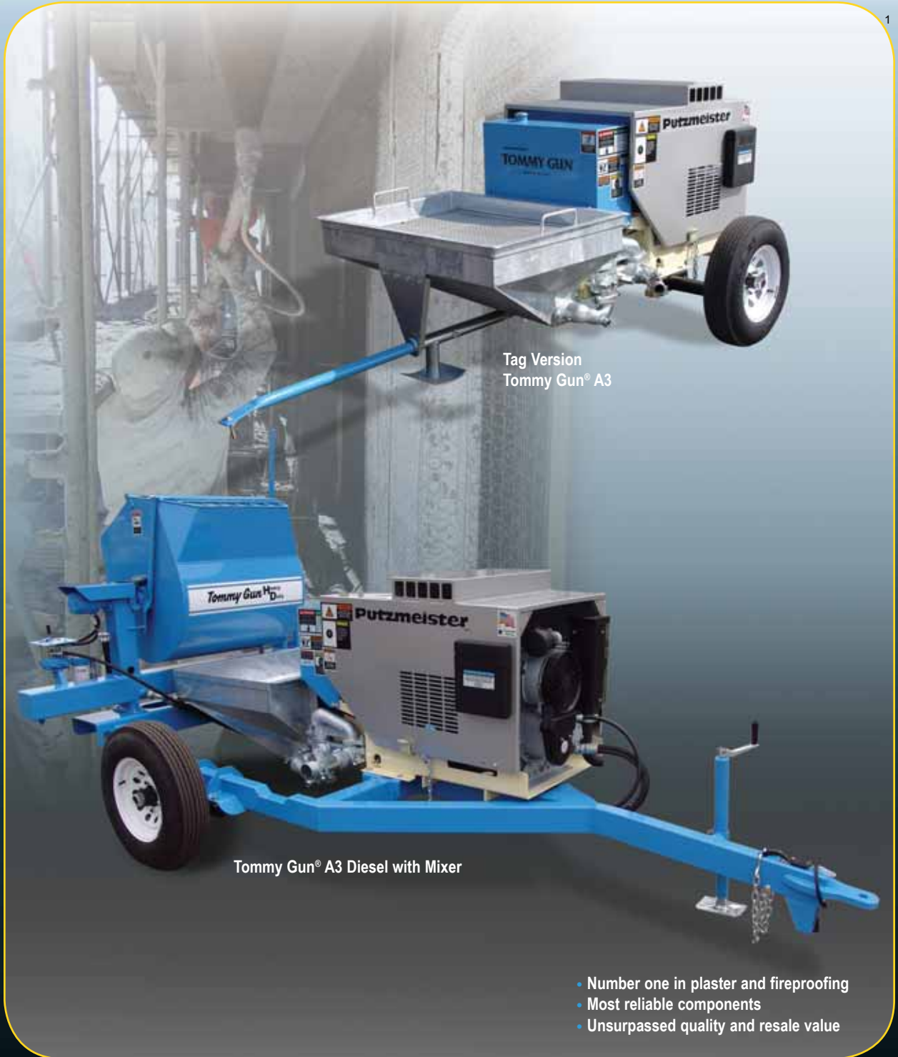
Tag Version Tommy Gun® A3