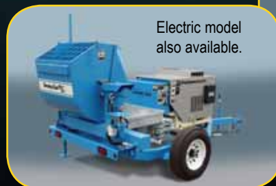
Electric model also available.

For high volume fireproofing, rely on the Tommy Gun with its large 3-3/4" (95mm) cylinder, long 8" (200mm) stroke and 3" (76mm) outlet to deliver up to 60 bags an hour. This mechanical piston ball valve unit also offers 4-speed variable drive and an adjustable two-position stroke for the smoothest pumping.